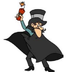
National dues collector